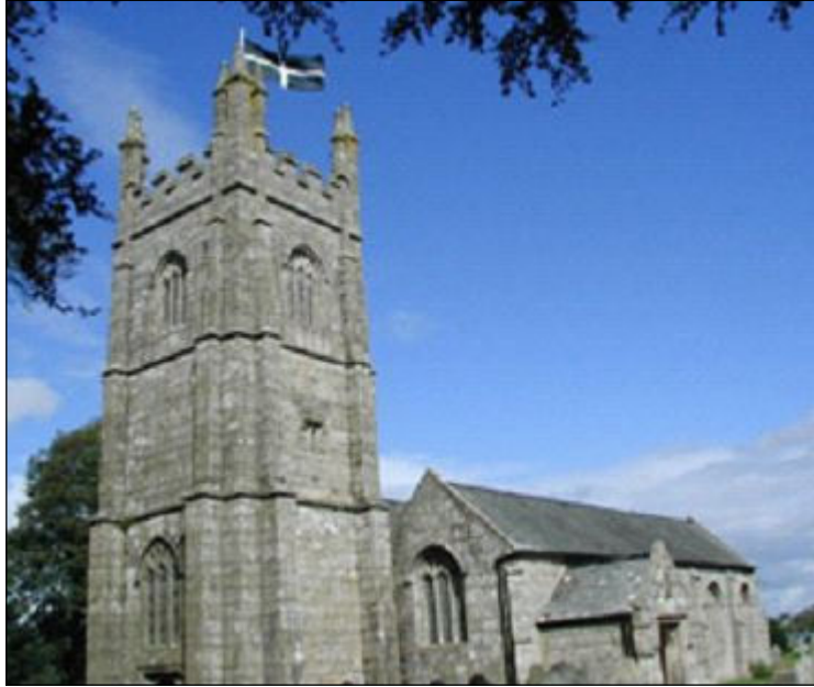
St Ivo's Church, St Ives, Cornwall

Sunday the 17th May was something of a milestone in the history of St Sampson's parish. For centuries, this church served not only the people of South Hill, but also the settlement of Callington. Eventually St Mary's church was built in Callington itself, but it has remained the 'daughter church' of St Sampson's to this day, and is still served by the same clergy. Indeed until the early years of the 20th century, the rectory was situated near the church, in South Hill.