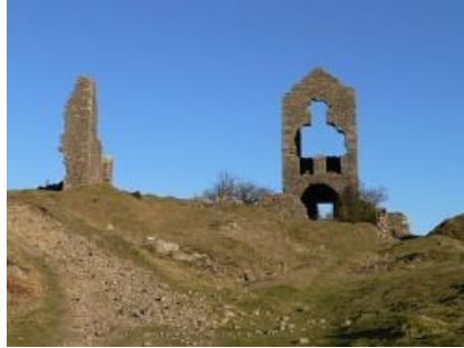
South Caradon Mine