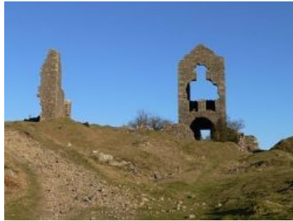
South Caradon Mine