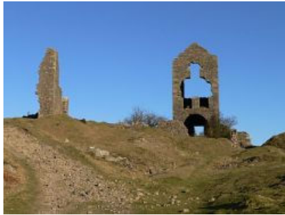
South Caradon Mine