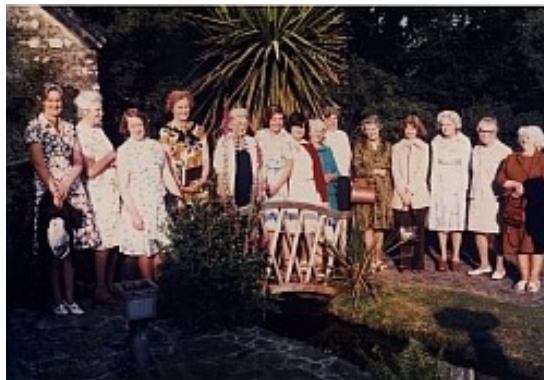
Ladies from left to right:

Manaton had a big garden with a stream through it, with a bridge and a pond. It was an ideal venue for garden parties so there must be lots of photographs out there somewhere. The only one I have is this one: