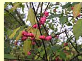
Spindleberry ( Euonymus europaeus ) click to enlarge

Most people who came to "Our Plan, Our Day" showed interest in the natural environment of the Parish.