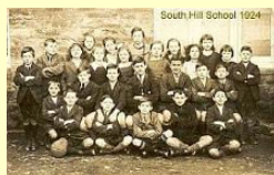
Click to enlarge photo

Our photograph this time is a real echo of the past. South Hill School in 1924. I wonder if you can identify any of the children in this picture ?